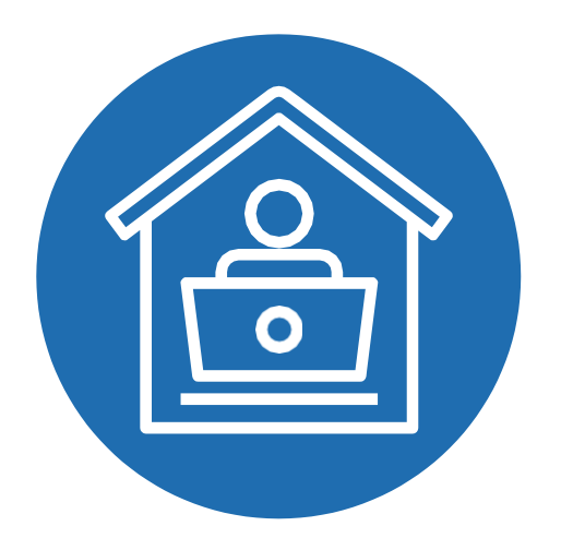
WORK REMOTEDLY IF POSSIBLE