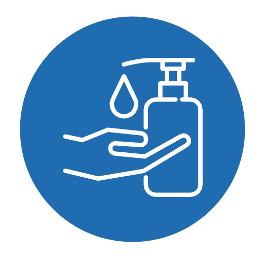
MAINTAIN GOOD HAND AND COUGHING HYGIENE