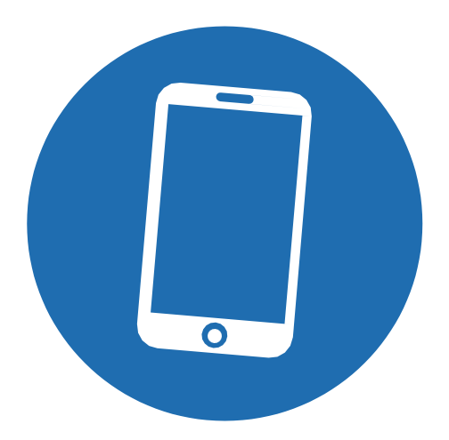
DOWNLOAD KORONAVILKKU - CORONAVIRUS MONITORING APP