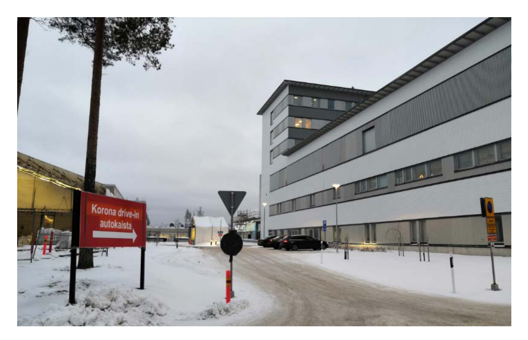
Follow the "Drive-in" sign - the test is taken outside of the hospital